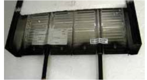
Fig.1: Label location exterior (On insulation, above water connection)