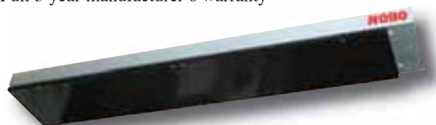
TVH Radiant Ceiling Mounted Panel Heater