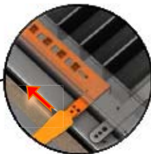
The secondary air is regulated by a handle and has to be manipulated using the “cold hand”