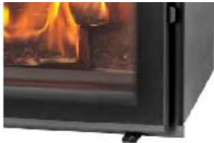
Lateral opening to facilitate the loading and the cleaning the glass