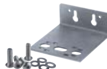
-K DP- wall bracket CODE RB7400021