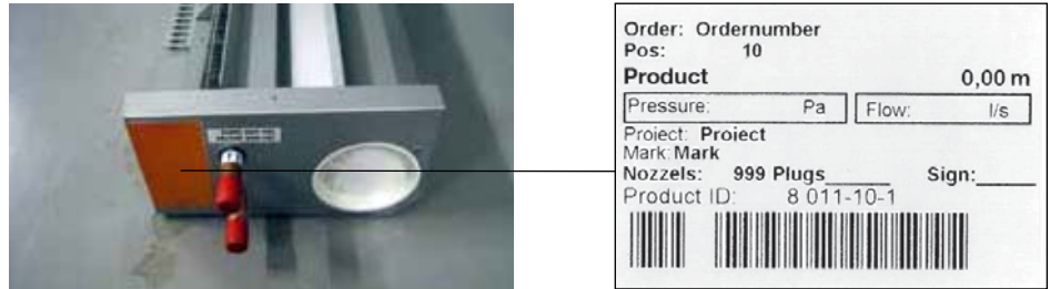
Fig.1: Label location exterior (Air connection end)